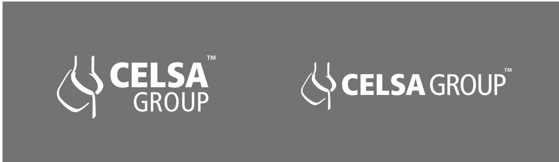
Pantone Cool Grey 10 C

Coloured logo will be used only on white background. In application with other authorized backgrounds: Pantones Cool Grey 10 C, 185 C y Black C, the entire logotype should be reversed to white.